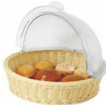
Round Rattan Basket with PC Roll Cover Size: Ø 410×200mm