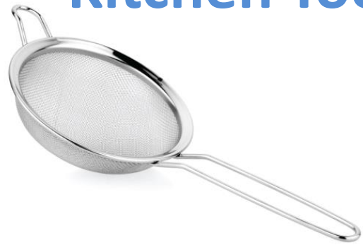
TEA STRAINER 7.5cm/9cm/11cm/12cm