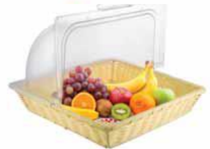
Square Rattan Basket with PC Roll Cover Size: 350×330×260mm