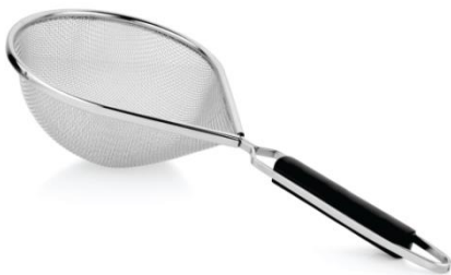
PASTA STRAINER 42 CM