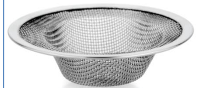
SINK STRAINER 11CM