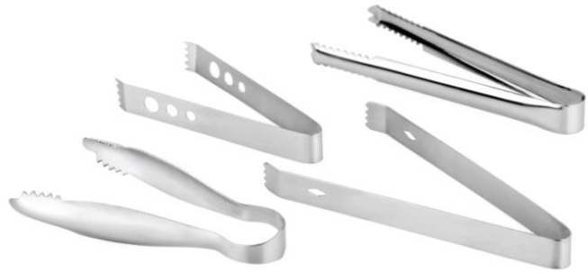
ICE TONGS ICT-101,102,104,105