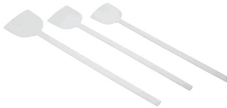
Dosa Turner 31cm/35cm/37cm/41cm