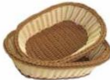
Oval Bread Basket 240×170×70mm (Small) 270×200×80mm (Medium)