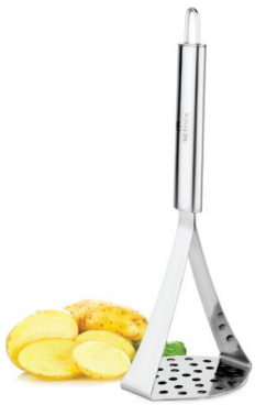
OVAL PIPE MASHER 25 CM