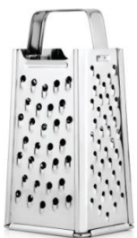
4 IN 1 Grater