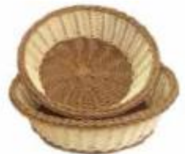
Round Bread Basket 200×200×70mm (Small) 230×230×80mm (Medium)