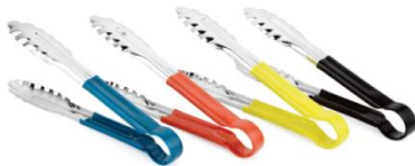
VINYL UTILITY TONG VT-9" & 12"