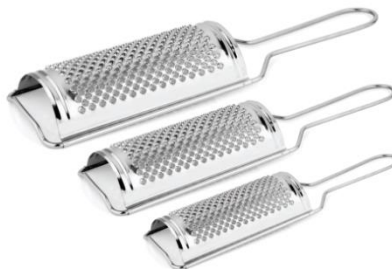
WIRE HANDLE GRATER 20.5CM, 27CM & 32.5CM