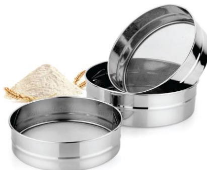
FLOUR STRAINER (17CM,19CM & 21CM)