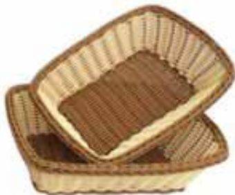
Rectangular Bread Basket 240×170×70mm (Small) 270×200×80mm (Medium)