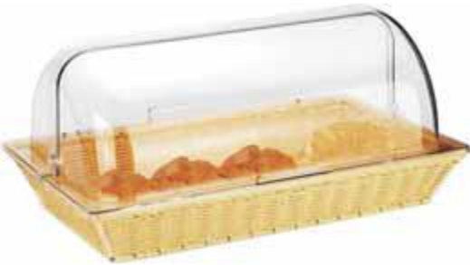
Rectangular Rattan Basket with PC Roll Cover Size: 530×330×260mm