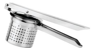
POTATO RICER 24 CM