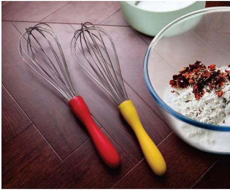
Color Whisk Size: 10" and 12"