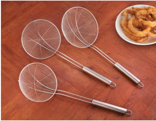
WIRE SKIMMER SS HANDLE 14CM/16CM/18CM