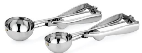
ICE-CREAM SCOOP SS/Black/Orange and Red Handle